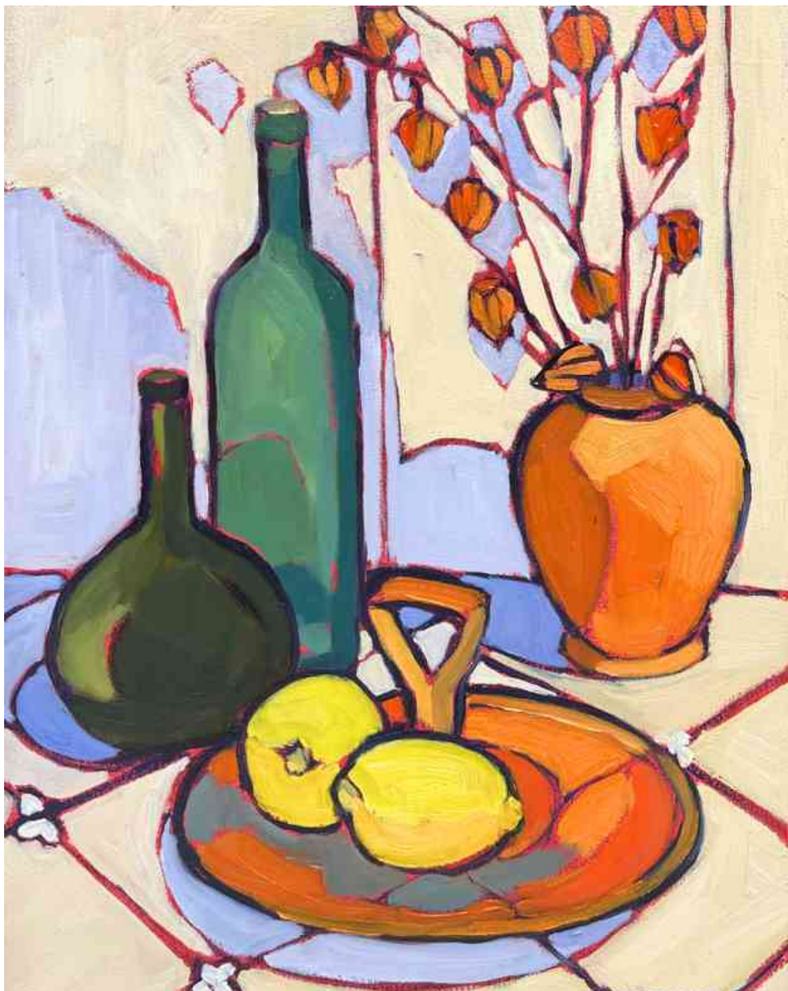
PERENNIAL FRUITS AND FLOWERS