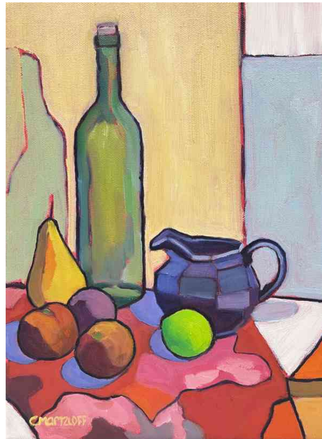
GEOMETRY OF COLOR