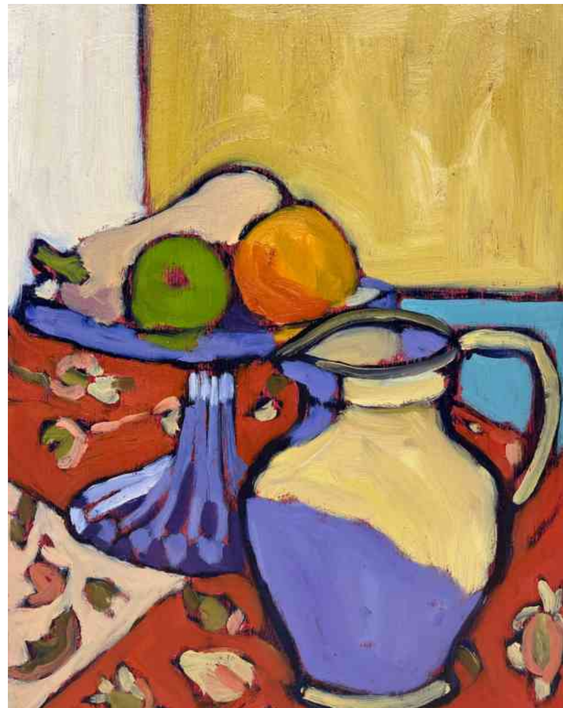
THE TASTE OF COLOR