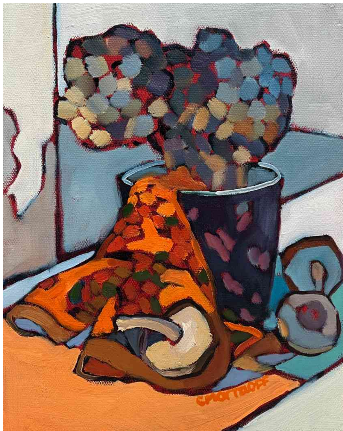
THE FORAGERS TABLE